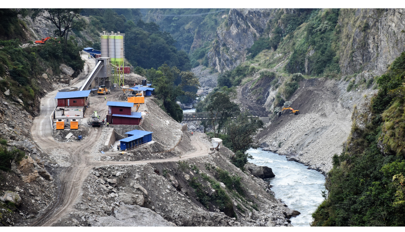
The construction site of the Upper-Trishuli 1 Hydropower Project.

Description : The UT-1 Project is a run-of-the-river project on the Trishuli River, 70 kilometers from Kathmandu, with a 216 MW power generation capacity. It is implemented by the Nepal Water and Energy Development Co. Pvt. Ltd. (NWEDC) - a Special Purpose Vehicle formed with participation of Korean Consortiums, the IFC and private Nepali investor (10%) (equity). <sup>114</sup> The investment received is the largest till date. <sup>115</sup>