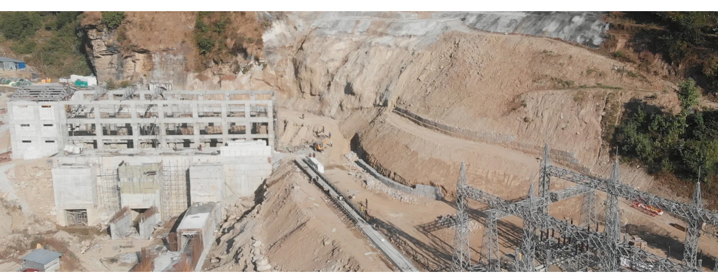
A construction of a Likhu River hydropower project in the Eastern District of Nepal

Description : The Likhu Hydropower Project is a cluster of 4 run-off-the-river projects <sup>89</sup> with a total of 329.6 MW (Likhu 1 with 77 MW, Likhu 2 with 54 MW, Likhu A with 51 MW, and Likhu IVA with 12.5 MW respectively) built across the Likhu River in the Bagmati Province, 220 kilometers from Kathmandu.