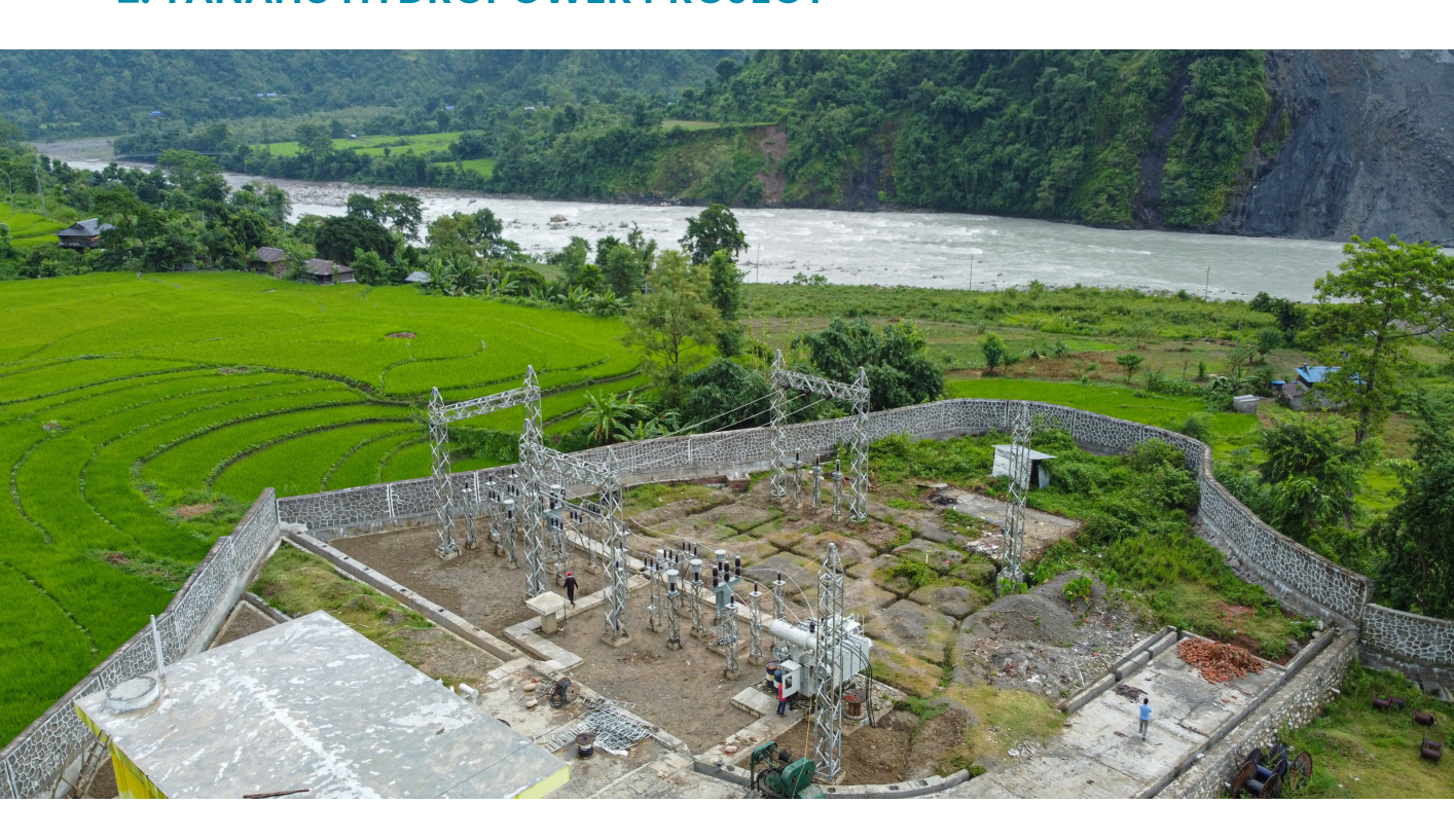
A construction site of the Tanahu Hydropower Project on Seti River in Tanahu district, central Nepal.

Description : The Tanahu Project is a 140-160 MW storage-type project that sits on the Seti River, about 150 kilometers from Kathmandu. It is also claimed to be the largest dam in construction, in Nepal, standing at 140 meters.