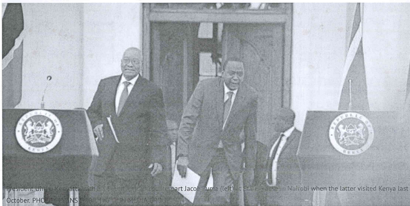
President Uhuru Kenyatta with his South African counterpart Jacob Zuma (left) at State House in Nairobi when the latter visited Kenya last October.

The Development Bank of Southern Africa (DBSA) is set to fund the construction of the Lamu-Garissa-Isiolo road at a cost of Sh60 billion, the Ministry of Transport has said.