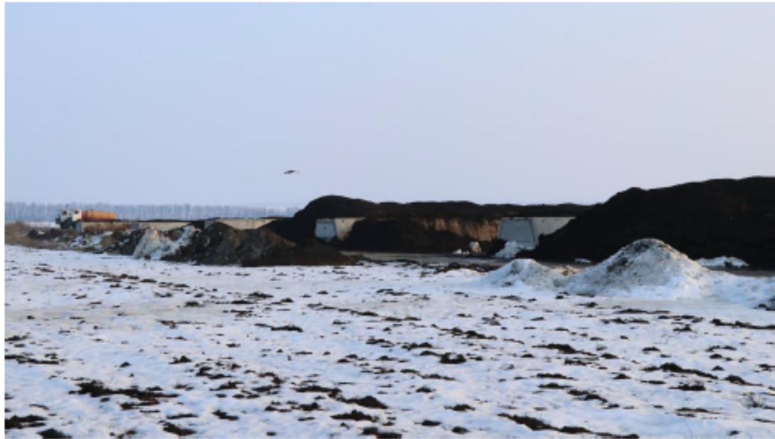
Chicken excrement lays uncovered in a manure storage facility.

Regarding smells emanating from chicken brigades, MHP has responded to this concern by stating that it complies with sanitary protection zone requirements, 124 characterizing the smell as “insignificant” and claiming that it “can be felt only in case of unfavourable strong wind. Discomfort is short.” 125 While the sanitary protection zone is welcome, MHP’s response has felt dismissive of what community members experience as a significant and ongoing problem.