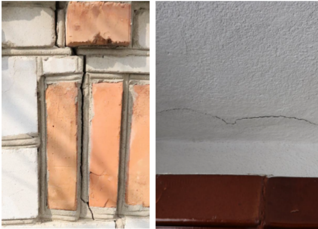
Cracks have appeared in recent years in residents' homes close to the road, both on building exteriors and along the walls and ceilings of interior rooms.

Impacts from MHP's heavy road use were foreseeable. In fact, MHP acknowledged them in meetings with community members in Olyanytsya in 2010. 101 Local residents have made numerous appeals for the immediate construction of the bypass road and other measures to address road impacts, dating back to 2012 or earlier. 102 In one such letter, community members in Olyanytsya again raised concerns about road impacts and presented a series of demands to MHP to address the issue, including construction of a bypass road, major road repairs, construction of sidewalks, speed limits, and an agreement not to construct any new brigades on Olyanytsya lands until these measures are carried out. 103 The Company and local officials agreed to implement all of the requested actions, 104 but to date, we have not seen any real progress.