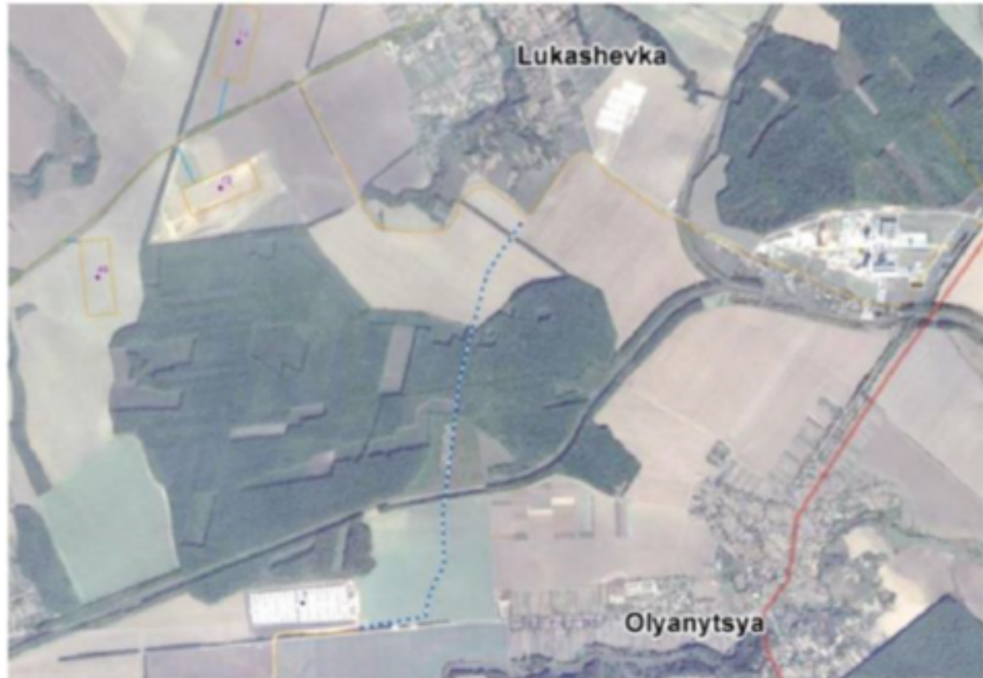
The planned Olyanytsya bypass is indicated by the blue dotted line.

Construction has been delayed time and again for various reasons, despite continuing promises that it will be completed soon. 107 Meanwhile, the Company's construction of VPF Phase 2 facilities has continued on time. We interpret this as a prioritization of MHP's profit-making operations over the interests and wellbeing of local communities.