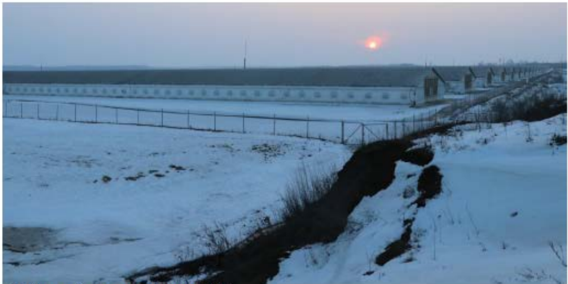
Existing poultry houses within the VPF.