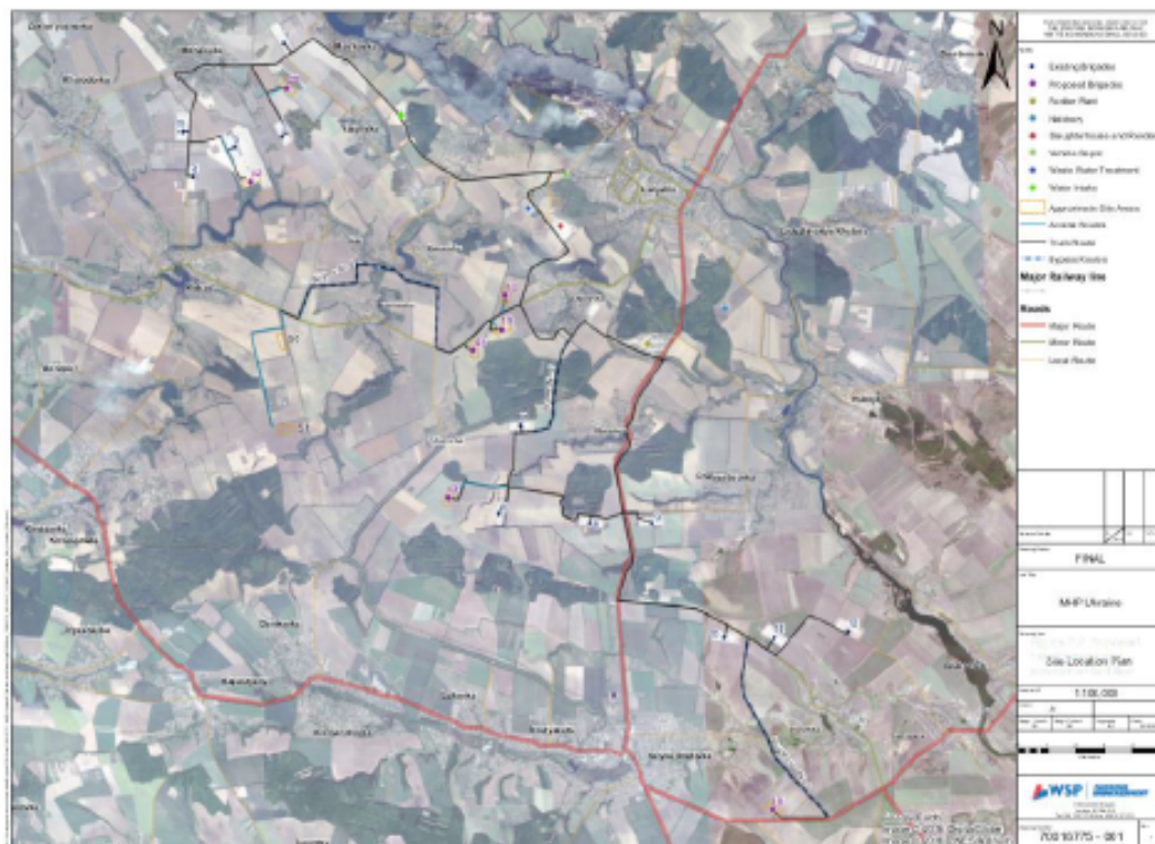
Approximate site areas are marked by yellow lines, while existing and proposed facilities are indicated by various coloured dots (see map key). This map is approximate as some facility locations have changed.

The “overall project area” of Phases 1 and 2 of the VPF will use an estimated 27,000 hectares of land in the Vinnytsia Oblast between and surrounding our communities. 19