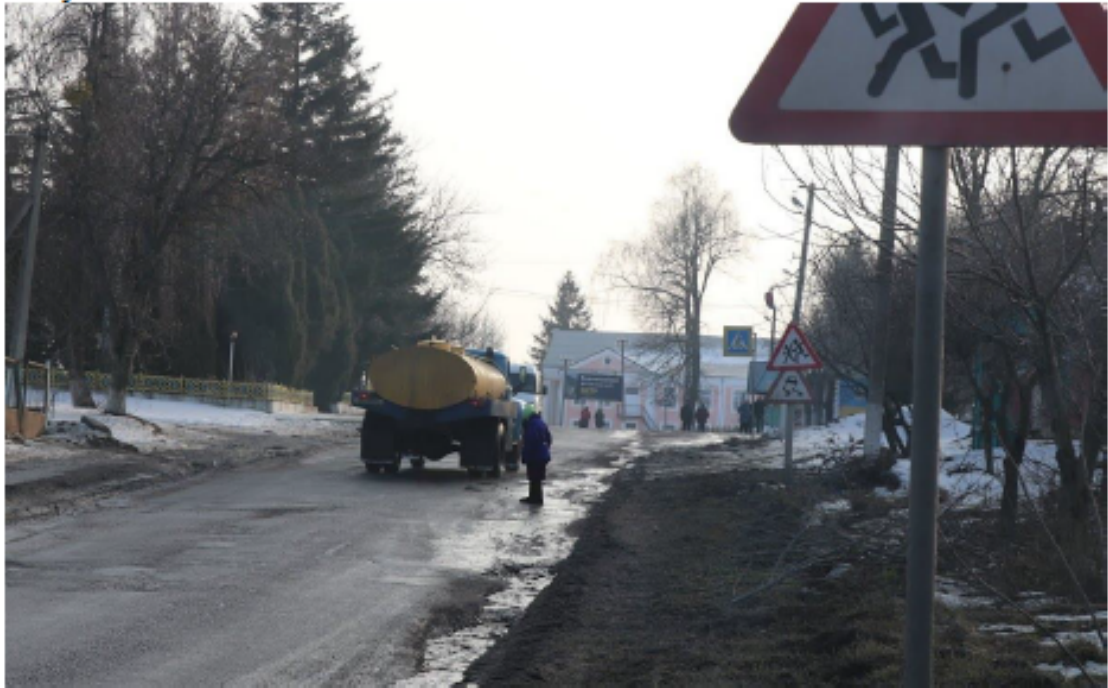
Large vehicles frequently utilize village roads creating risks to pedestrian safety and damage to physical property.

significant negative impacts caused by heavy traffic from large industrial vehicles associated with the Project.