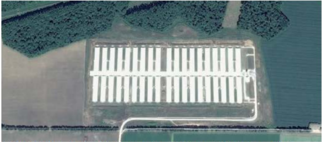
The typical brigade layout. Each brigade requires a total area of 25-30 hectares of land and can house approximately 39,060 chickens at a time.

Each brigade consists of 38 poultry houses and has a capacity of approximately 1,484,280 chickens (broilers), meaning that there are currently as many as 17.8 million chickens being reared in the VPF at any one time. 18