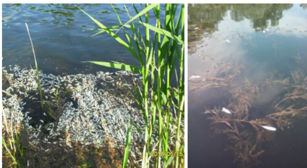
Community members reported seeing dead fish floating in the river near the outflow pipe of the wastewater treatment. Source: Facebook (see further Annex 6).

We are also concerned that other MHP practices may contribute to unknown pollution impacts, such as its use of pesticides and application of used water from poultry houses to irrigate crop land. For example, on 6 May 2017, a local resident witnessed pesticide spraying on a field leased and controlled by the Company across the road from her residence, at a distance of about 10 meters from her land and without prior notice to her. 131 Recently, on 4 May 2018, the same community member again noticed Zernoproduct Farm spraying pesticides close to her residence and without prior notice. This recent incident was again raised through a phone call to MHP's Corporate Social Responsibility team, and after that the spraying did eventually stop, but we fear such incidents may continue to occur. Community members fear that spraying of pesticides may lead to potential pollution of soil and groundwater, as well as unknown health impacts for local residents. Disposal of treated wastewater in the Pivdenny Bug River raises similar concerns. 132 For example, in May 2018 local community members noticed dead fish floating in the river near the outflow pipe of the wastewater treatment plant and we fear that this may have been related to the Company's operations. 133