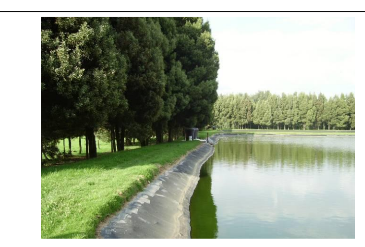
Photo 4: Treatment lagoons (final basin, southern train)

to the treatment lagoons located between the two runways to the west of the airport (see photo 3). During the visit of the ICIM technical expert, the lagoons were found to be well maintained, with no visible accumulation of foam or detritus (Photo 4).